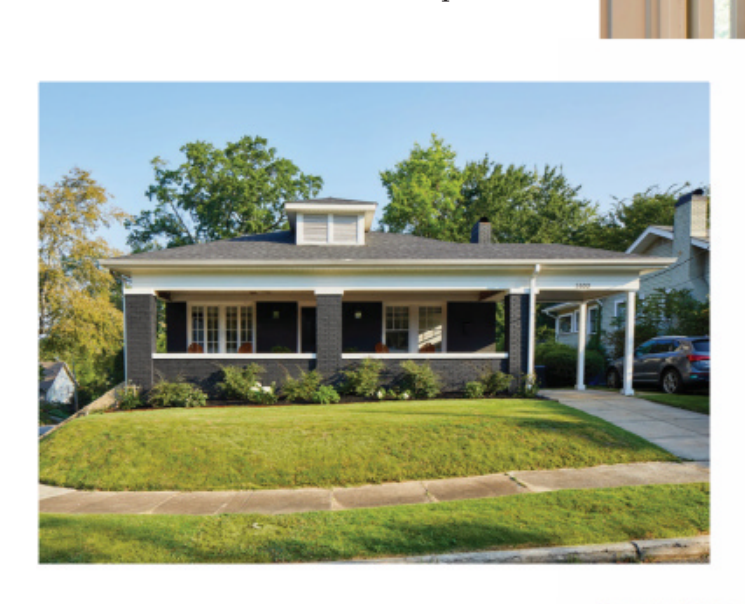
Curb Appeal "Most of my clients ask for bright white and prefer clean shades, but I wanted a dark, moody color story for my own home," says Ellen, who swathed the brick exterior in black.

room. The sofa pulls out into a queen-size bed, and the French doors close for privacy. The walls were originally dark brown, so we installed board-and-batten siding with a bold persimmon Rifle Paper Co. wallpaper above it." SL